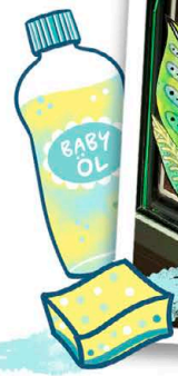
Great to combine: Multimarker and the "magic oil trick".