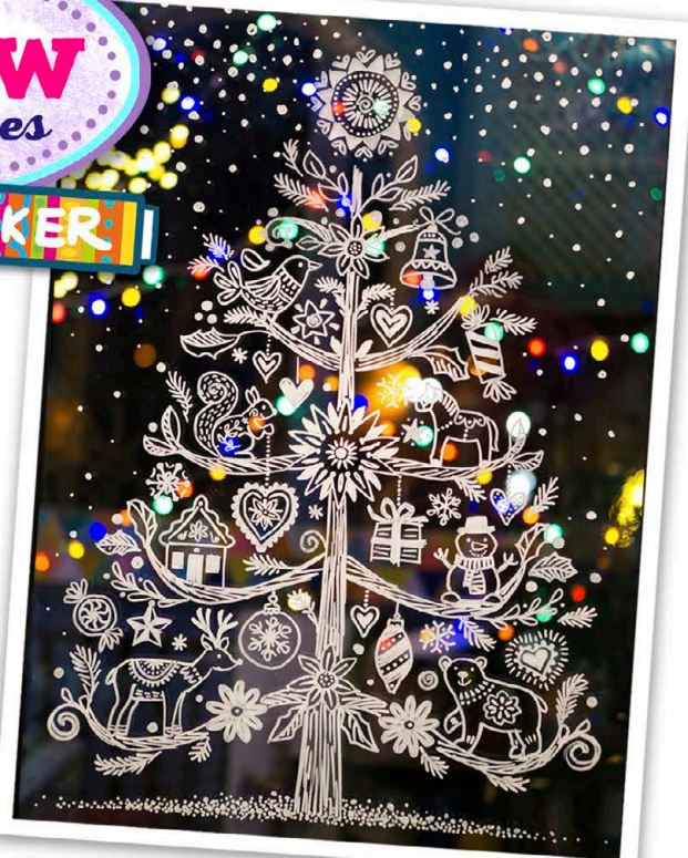
All in white, the motifs look particularly impressive at the window.