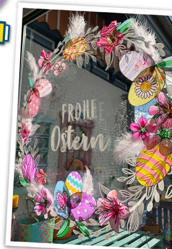
The Easter wreath is a combination of tracing and coloring.

You have acquired copyrighted material for private use: Please do not put the acquired files on the internet and do not pass the files on to third parties. Thank you very much for your understanding. Teachers and educators can of course use the templates together with their children's groups.